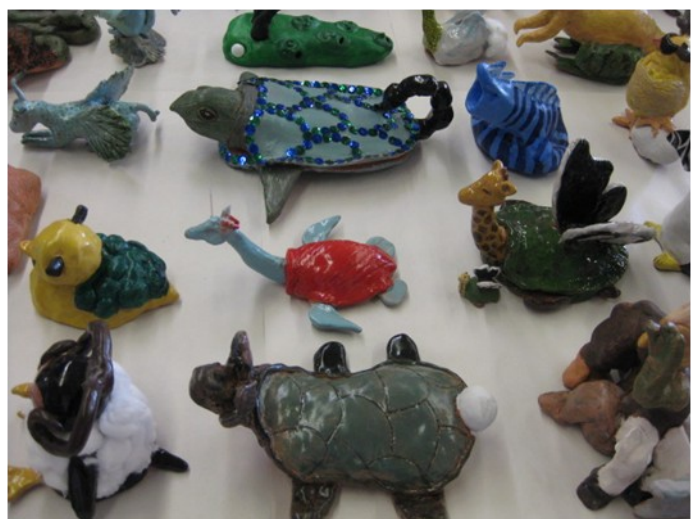
Some ceramic hybrid animals

Finally, congrats to our grads --- may the forces be with you!